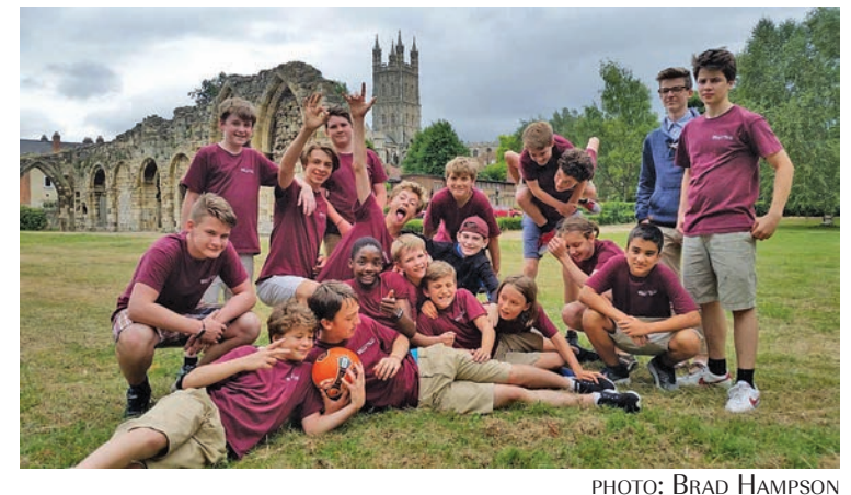
Christ Church Catherduch a baile and during a series

ottawa.anglican.ca/ All-My-Relations.html