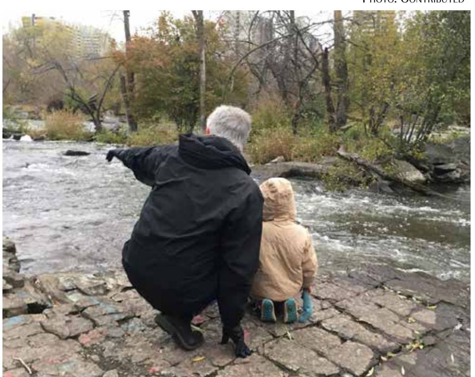
Reading the rapids.

Being in a grandparent-grandchild relationship is new to me because my grandfathers died before I was born, and my grandmothers lived in Ireland. While being kind of dad-like works for me, I realize that grandparenting has a different quality because one is less focussed on the immediate tasks of nurturing a child through the stages of development, which opens up enormous possibilities for unstructured companionship, listening without judgement, telling outrageous anecdotes, and offering spontaneous teachings about cool things one has