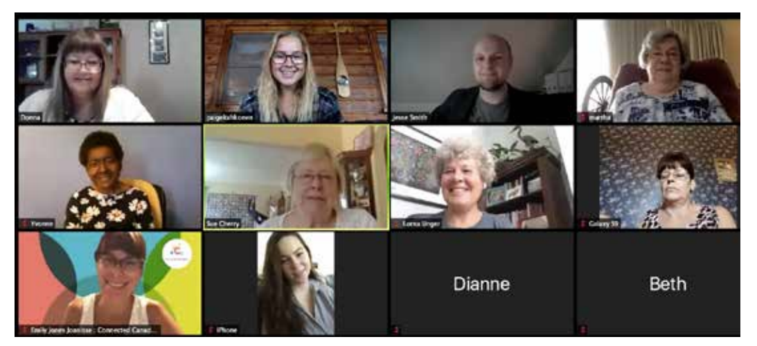
The Tuesday morning Zoom conversations organized by these parish volunteers became such a hit they started up an every-other-Friday one too.

The second initiative was called 'Seniors in Conversation' and began in June. It was created by the